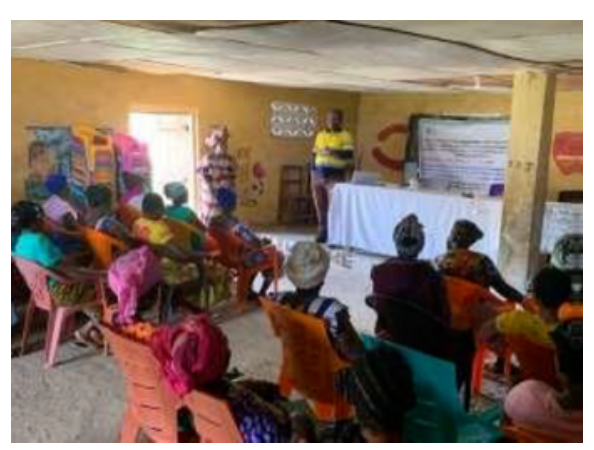
MWomen training in Tonkolili district.