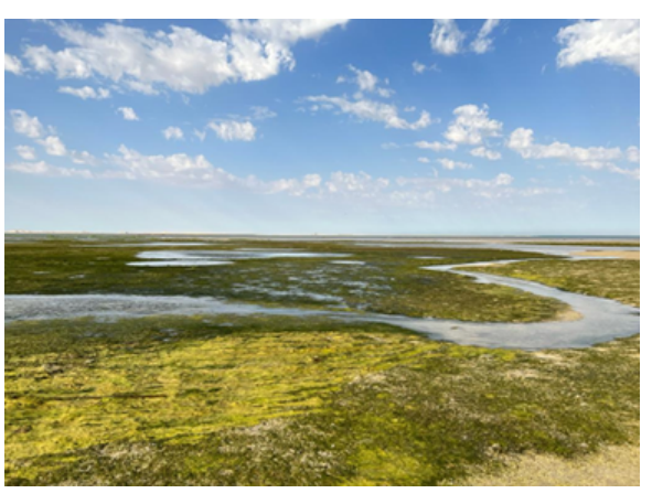
Seagrass provides ecosystem services in La Baie de l'Etoile.

Field Mission in March 2023 in Mauritania, to Support the Conservation of "La Baie de l'Etoile"