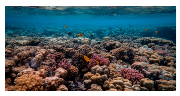
GCRMN Western Indian Ocean.

The regional coral reef network in the Western Indian Ocean has been active since 1999, coordinating and reporting on coral reef monitoring activities through the Nairobi Convention Coral Reef Task Force (CRTF) and the Global Coral Reef Monitoring Network (GCRMN), with support from partners. The Nairobi Convention CRTF was established based on a Decision made at the third meeting of the Nairobi Convention Conference of Parties (COP3) in 2001.