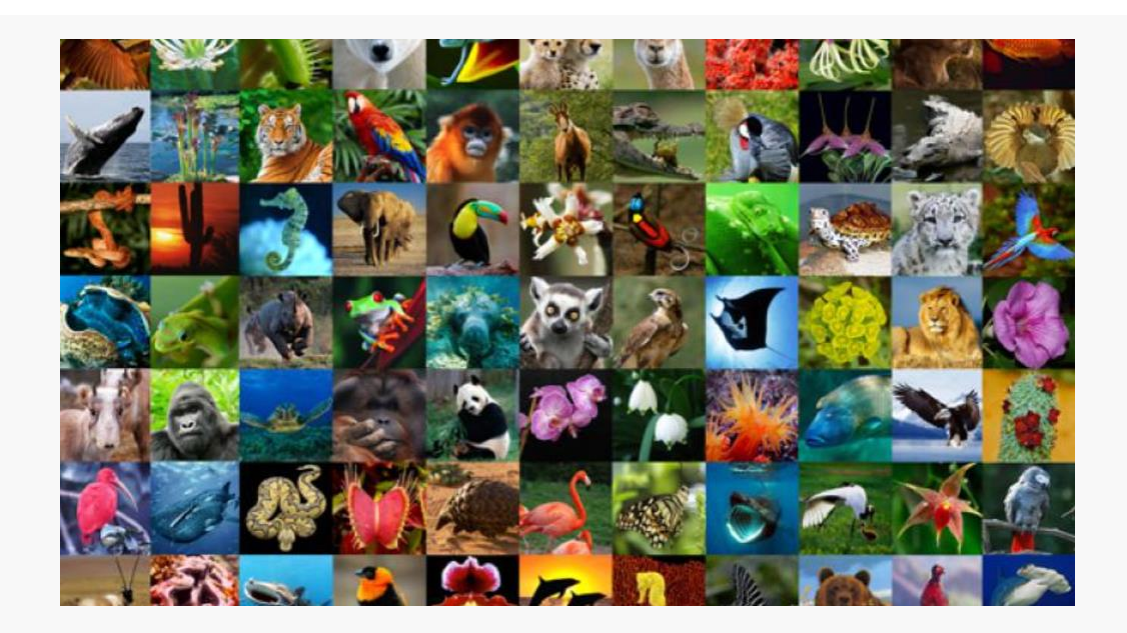
SPREP: Pacific Regional Preparatory Workshop for the Second Intergovernmental Negotiating Committee (INC2)

The Pacific Regional Preparatory Workshop for the Second Intergovernmental Negotiating Committee (INC-2) was held in the Cook Islands from 24-25 April 2023. The workshop was coordinated by SPREP and funded with support from the ACP MEAs 3 programme and the Government of Australia. The objective of the workshop was for the Pacific Islands to enhance their regional strategy and reflect their concern in the internationally legally binding agreement on plastic pollution, including marine environment. The INC2 meeting is scheduled to take place in Paris, France, from 29 May to 2 June 2023. The Pacific region is disproportionally affected by plastic pollution: while the region contributes to only 1.3% to global plastic pollution, 98.7% of the 8 million tons of plastic in the Pacific Ocean come from outside sources. Read more.